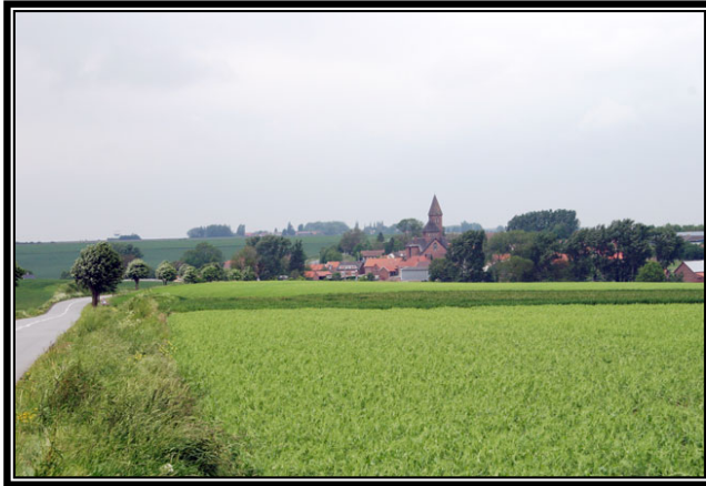
Figure 11: [11] The view of Noreuil as seen by the soldiers 50 th Battalion including Wilfrid, looking north towards the village.

The 50 th Battalion replaced the 20 th Battalion which was responsible for the central section of the line which ran between Lagnicourt and Noreuil, overlooking Noreuil to the north -[33] . [as seen in the modern photo in Figure 11 ].