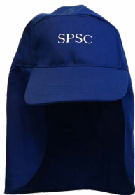
Early Years, Prep to Year 2