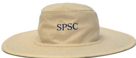
Whole School Years 3 to 12