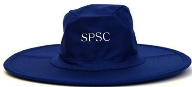
Junior School hat Years 3 to 6