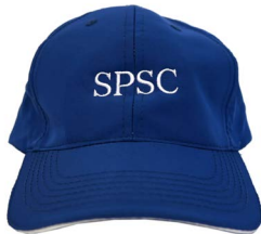
Senior School cap Years 7 to 12

Students who do not have a hat must stay out of the sun.