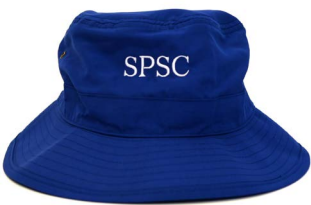
Senior School hat Years 7 to 12