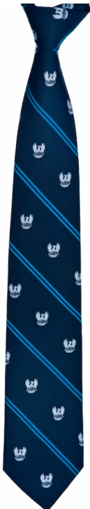
School &amp; Allen